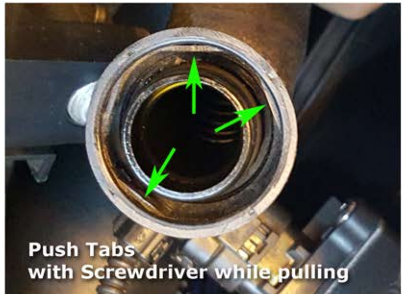
Push Tabs with Screwdriver while pulling